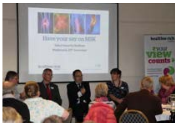
Question time at our MSK event - December 2014

Feedback from CCG Engagement Event - March 2015