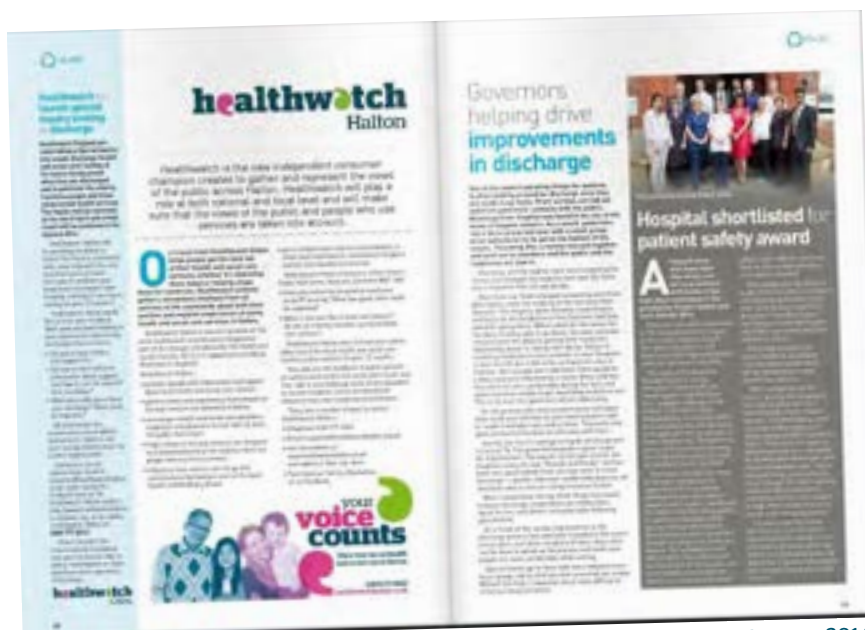
Warrington & Halton Hospitals NHS FT 'Your Hospitals' Magazine - Summer/Autumn 2014

However, we have not carried out any work specifically targeted at gaining the views of those who volunteer or work in Halton but may not live here. However, we have promoted Healthwatch and encouraged feedback from people through media articles within in-house magazines produced by large local employers such as Halton Borough Council, Warrington & Halton Hospitals NHS FT, Bridgewater Community Healthcare NHS Trust and 5 Boroughs Partnership FT. We also know from our outreach work and the feedback and comments we have received that these groups of people are represented in the information we gather.