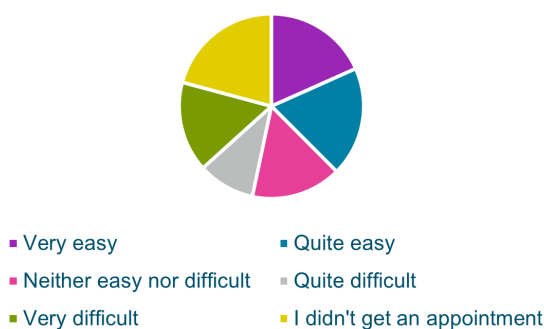
Ease of Booking Appointment