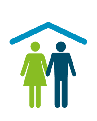
Gender - 41 answered the question and 0 skipped the question

The demographic breakdown of those individuals who completed the survey for both areas is given below: