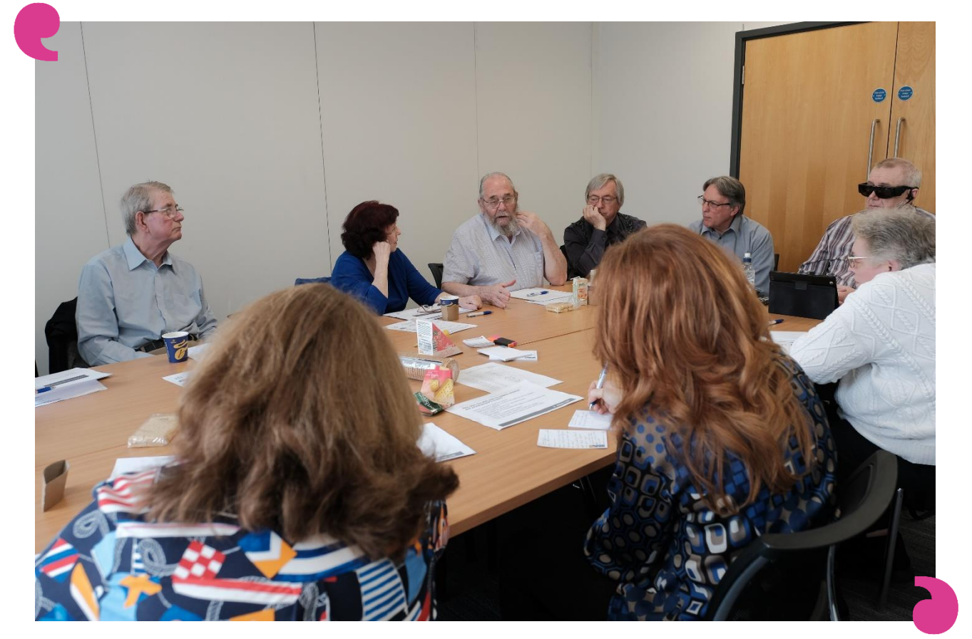
Our volunteers training and sharing views