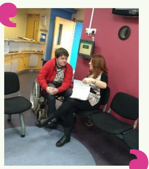
A patient sharing views and experiences at a GP surgery

'Your visit has certainly helped us focus our minds, not only on what we are doing well, but also on areas where we know we need to improve in addition it has also highlighted further areas where we need to develop and improve our service to patients'