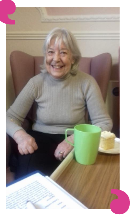
Sharing views and experiences at a local care home

Volunteer – "I really am feeling valued, welcome and part of the professional team (considering I am a volunteer). That takes some doing!!!"