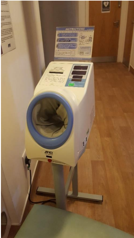
Free to use blood pressure machine