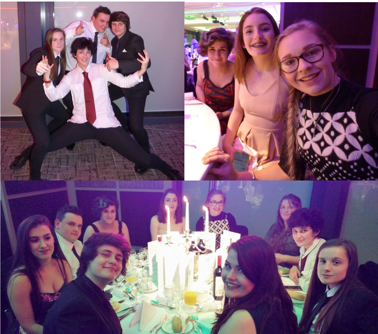
Children and Young People NOW! Awards (shortlisted for the Youth Volunteering and Social Action Award)