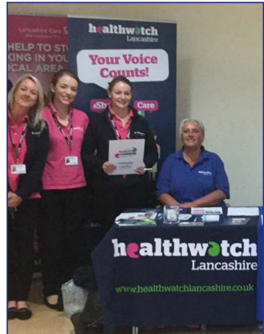
Pictured: The Healthwatch Lancashire team on the Patient Engagement Day at Royal Blackburn Hospital.