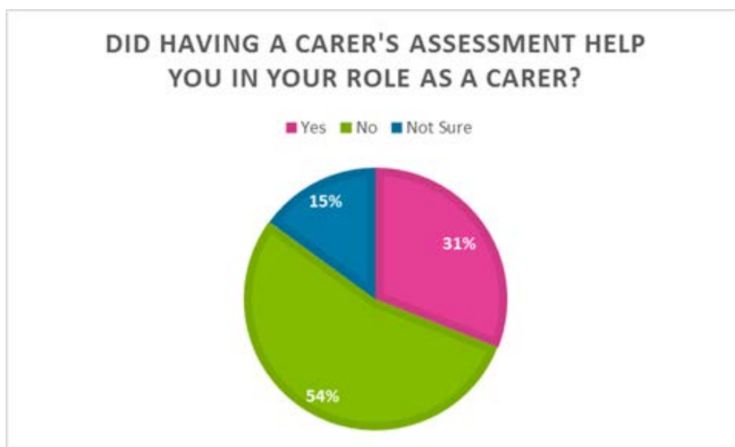
Figure 1. Whether having a Carer's Assessment has helped them in their role.

This could be because information or expectations about what impact an assessment might achieve does not meet with the reality experienced by carers. It raises the question about whether the workers undertaking the Carer's Assessments understand the main problems experienced by people providing care or the options available for follow up care. It also questions whether the Carer's Assessment process is responsive enough to individual's needs, allowing creativity to find the personalised support that carers need.