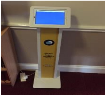
IPad feedback station, part of Four Season's "Quality of Life" Programme