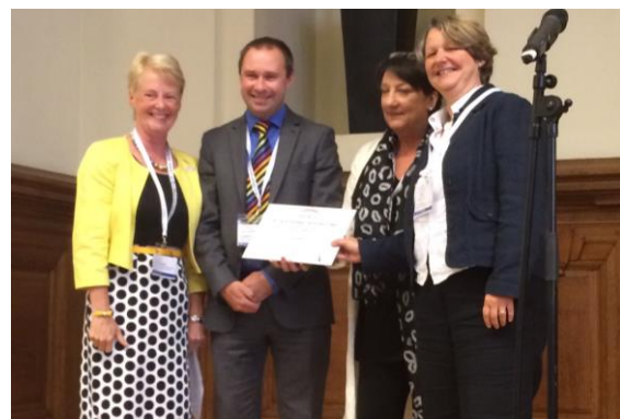
Devon Local Optometry Committee winning

We were also delighted to attend the Poster Awards ceremony at the conference where Devon Local Optometry Committee won the Outcome One section with their “promoting the eye care in Devon” poster.